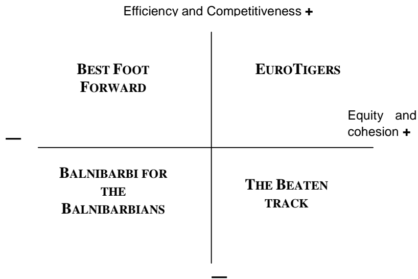
Figure 1 Scenario overview

Bearing in mind that the original idea behind the Lisbon strategy is economic growth rather than social cohesion and the environment, only two of the four economy scenarios will be worked out in detail, one where the “back to basics” approach described in the midterm review is dominant (best foot forward), and one which strives for growth in the context of “territorial cohesion” as understood in the ESDP (EuroTigers). 3 The presentation includes a short recap of the motivation behind the scenario, the political context, and the