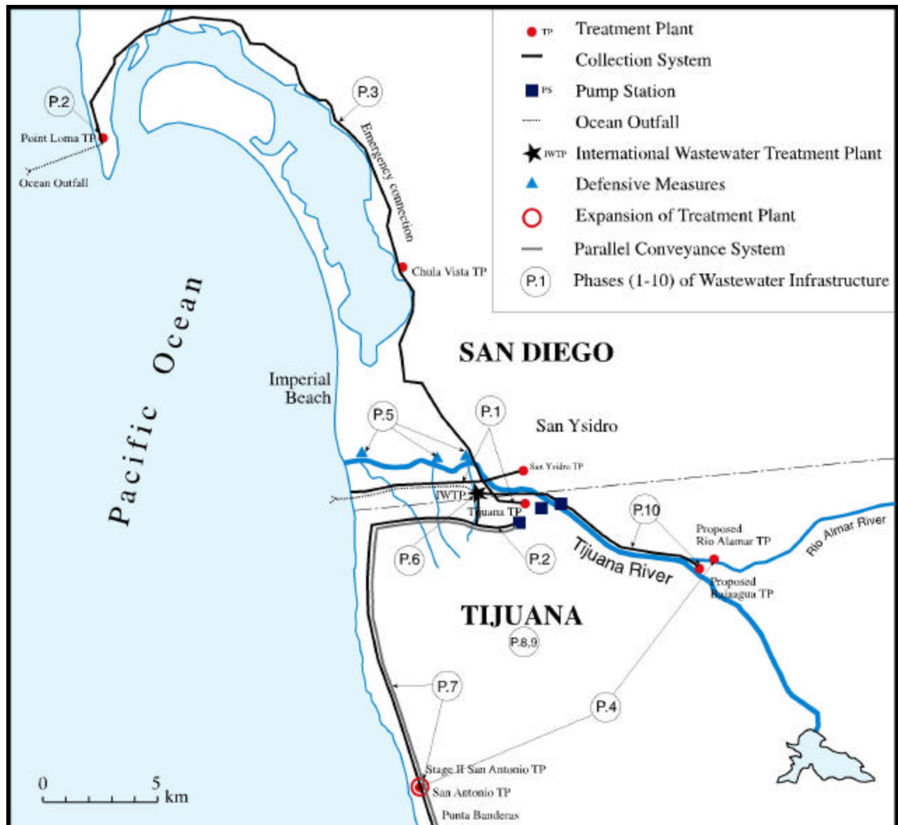
Figure 1: Location map and phases of wastewater infrastructure