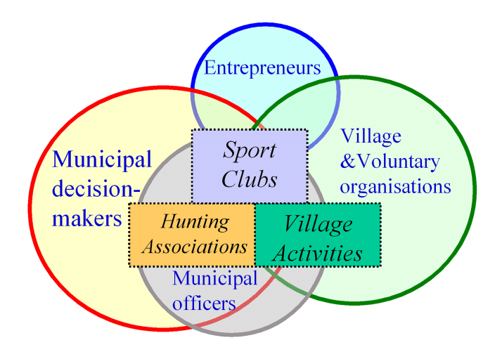
Figure 4: Overlapping memberships of respondents in Sotkamo

implementing various programmes of development, such as ministries and national agencies of development.