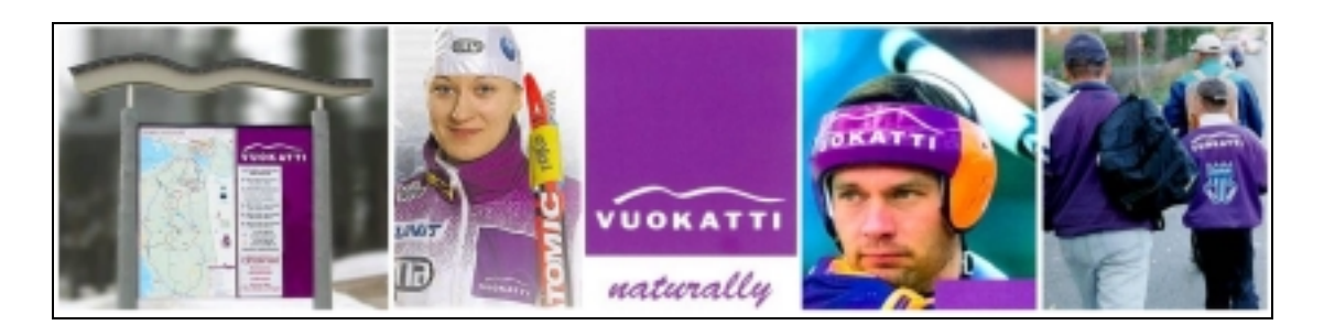
Figure 2: The New Vuokatti brand is used both in tourism and in sports.

The development of tourism and the construction of the image have taken place hand in hand. Some new resources available, for example from the EU programmes, have been utilised. The representatives of Sotkamo have secured that the strengths of Sotkamo are listed in the priorities of the Kainuu Regional plans, e.g. tourism, ski tourism, electronics, food manufacturing. Regional programmes have brought funding to several large projects of Sotkamo (such as the Ski Tube, Vuokatti Centre, Snowboard Tube). Before them several investments had been made in Vuokatti sport facilities (ice hockey hall etc). Focusing the efforts into the strengths has resulted that the municipality has not been eager to put resources into rural development and "small" village development projects, or cultural projects. This has created critical attitudes among these groups.