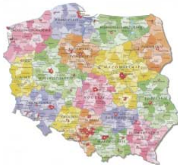
Fig. 2 The administrative division of Poland.

In today's Poland, there are 16 self-governing voivodships at the regional level of administration, 380 poviats (including 65 towns being poviats themselves) and 2489 gminas Żebrowska-Cielek (2001).